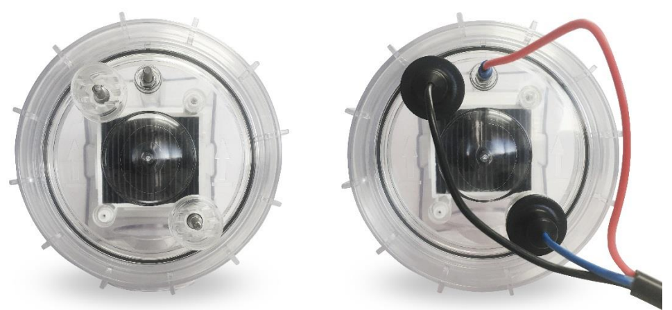
Cell Cable Connection